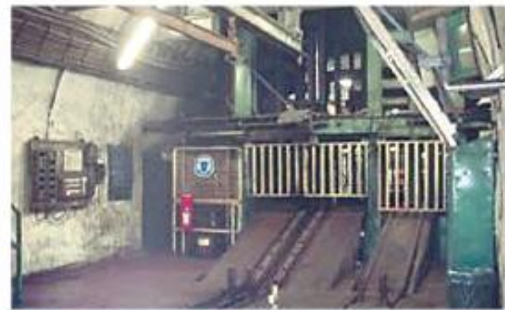
Magnet switch iKA168 used for securing a pit gate